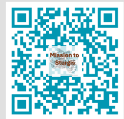
https://forms.gle/uHEboQzKUNdByNfG7 MISSION TO STURGIS Sign Up Link

OFFICIAL F.A.I.T.H. RIDER SIGN UPS FOR STURGIS RALLY