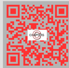
https://faithriders.com/chapters Find A Chapter