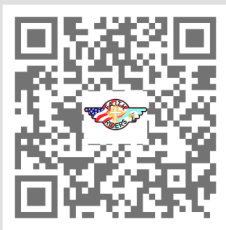
https://store.faihriders.com F.A.I.T.H. RIDERS STORE

The following QR Codes and their website links are provided here for your convenience. These are all available from our website at: www.faihriders.com