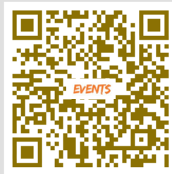
https://faihriders.com/our-events/ LISTING OF NATIONAL EVENTS