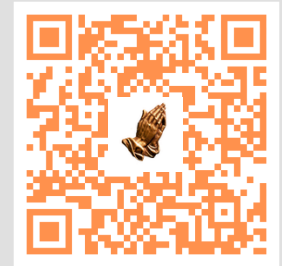
HTTPS://FORMS.GLE/9WspHF6rQTDCj3Xq6 Sign up for Prayer Mission for Sturgis