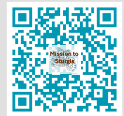
https://forms.gle/uHEboQzKUNdByNfG7 MISSION TO STURGIS Sign Up Link

OFFICIAL F.A.I.T.H. RIDER SIGN UPS FOR STURGIS RALLY