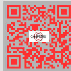
https://faihriders.com/chapters Find A Chapter