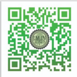
https://pushpay.com/g/faihriders?src=hpp IN FOR 10 DONATION LINK