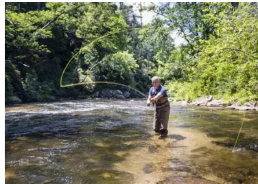
and the joy of fishing are but some of the activities that we enjoy.

We also enjoy extended visits with family and friends and the backyard BBQ's roar back to life. Our minds look forward to a slower pace and often we attempt to nail down family vacation plans. VBS is now firmly in our sights with preparations beginning.