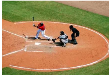
the advent of a new Baseball season,