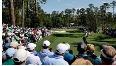
The Masters Golf Tournament,

the Final Four Basketball Tournaments (Men's and Women's),